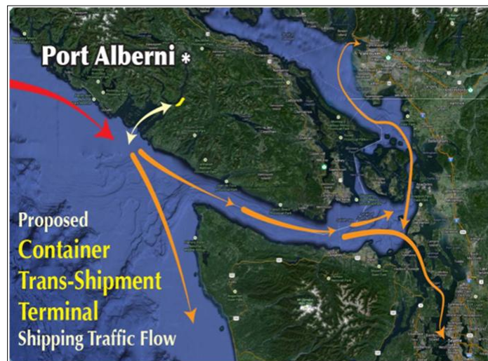
Figure 1.1: Schematic Diagram of Possible Shipping Flow for PATH Terminal

The Port Alberni Trans-shipment Hub is intended to be a large-scale intermodal container terminal where ultra-large container ships (ULCSs) will be unloaded and their cargo transferred onto large feeder barges that will transport the containers to their final destinations throughout the Lower Mainland and possibly in Washington State and further south along the coast. A preliminary schematic diagram of possible shipping flows for the PATH Terminal is shown in Figure 1.1.