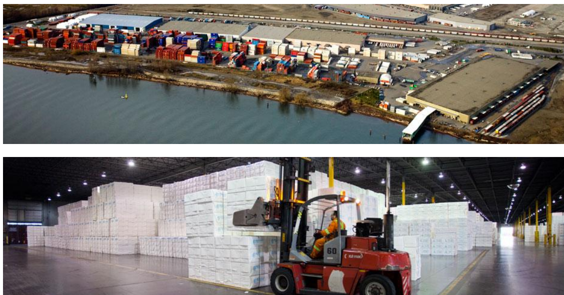
Figure 3.8: Coast 2000’s Warehouse and Distribution Centre in Lower Mainland

Most of these are the types of services that are being provided in Prince Rupert by Quickload Logistics and in the Lower Mainland by a number of operators including a company called Coast 2000. This is a fairly large-scale operation and exterior and interior photos of Coast 2000’s facilities are shown in Figure 3.8.