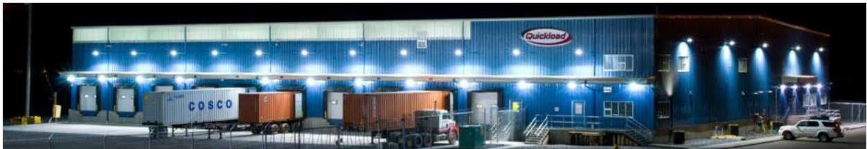
Figure 3.6: Quickload CEF Warehouse in Prince Rupert

Container Examination Facility that meets their specifications. In Prince Rupert this facility was developed by the private sector and is operated by Quickload CEF Inc., which not only operates the CEF, but provides other container and freight-related logistical services under the operating name Quickload Logistics. A photograph of the Quickload warehouse facility on Ridley Island, which includes the CEF, is shown in Figure 3.6.